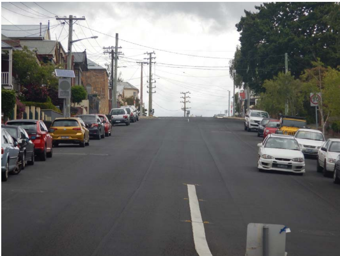
Figure 5 Variable speed sign on Forest Road and school crossing in background. Variable speed sign is opposite of a fixed 50 km/h sign that is obscured by tree foliage.