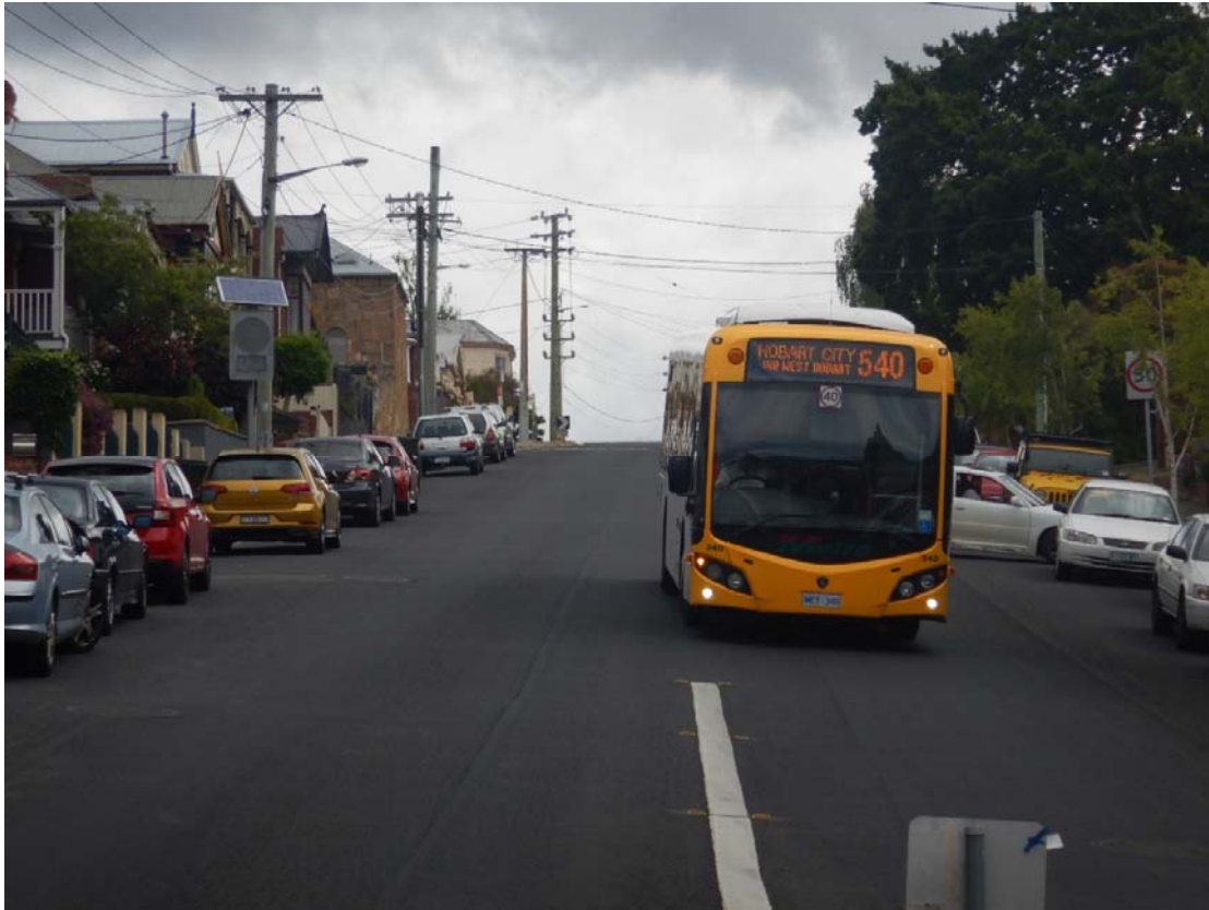
Figure 4 Forest Road is a Bus route