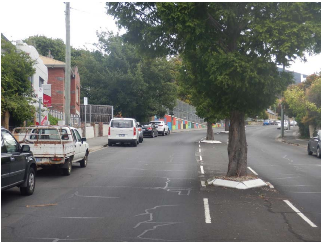
Figure 7 View from Goulburn Street Road with the school's tennis court in the background. Note Variable speed sign obscured by tree. No sign indicating the presence of a school. Trees in centre lane obscuring view.