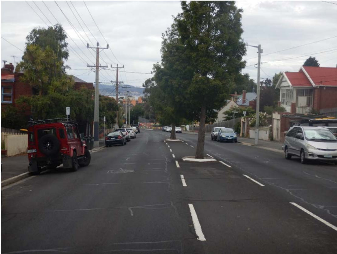
Figure 16 Down Hill Traffic view of the school crossing from further up the street. Note trees in centre line obstructing view