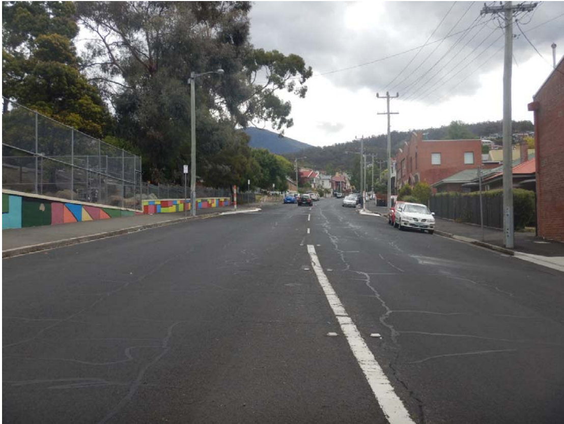
Figure 9 View of school crossing on Goulburn Street from uphill lane. School Crossing flag posts are barely noticeable Photo taken at about 4 pm