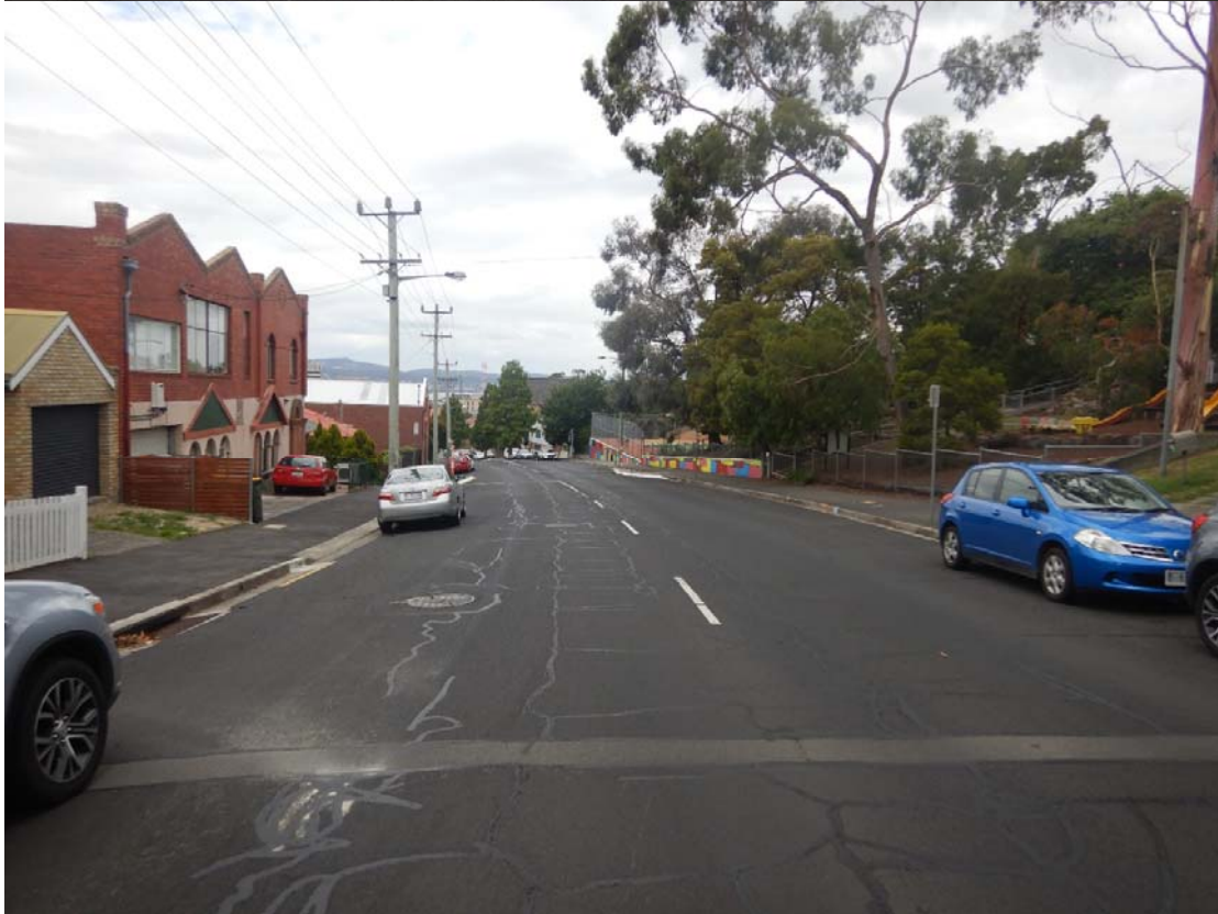
Figure 13 Goulburn Street School Crossing view of Down Hill traffic