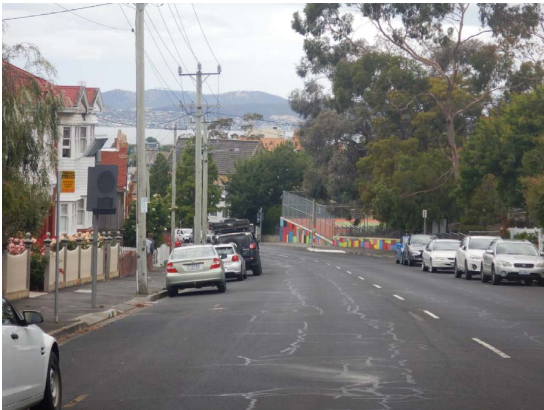
Figure 15 Close up of variable speed sign for downhill traffic. Note Signage is blending into street scape and no signage indicating the presence of a school. Crossing itself is blending into street scape