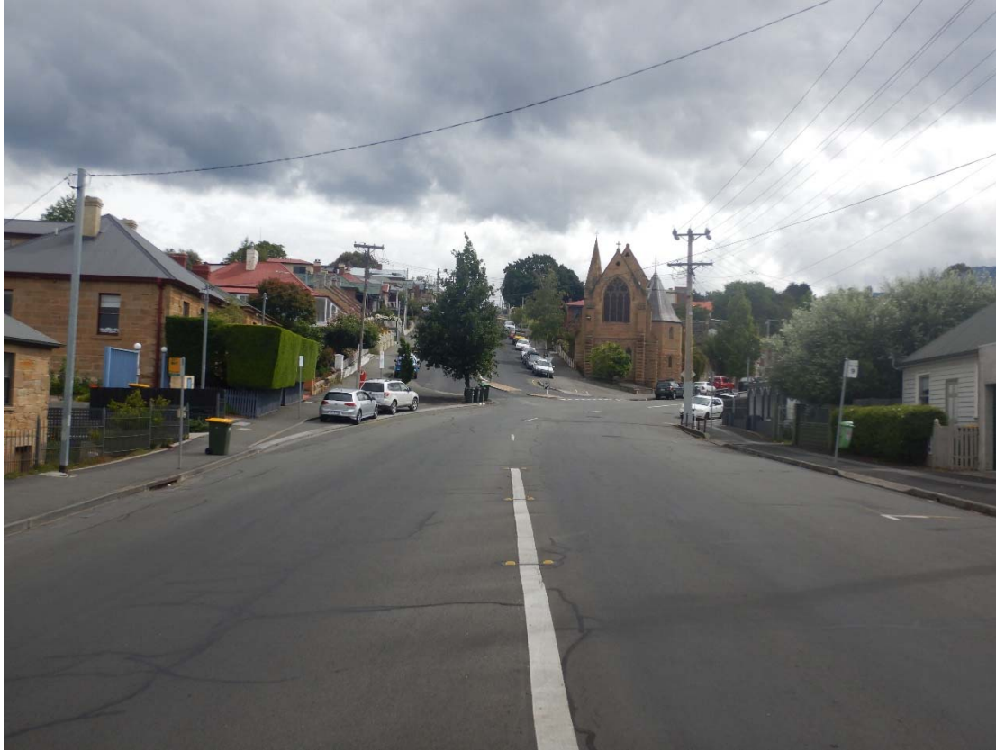
Figure 1 View from Mole Street traffic light island towards the Forest Road intersection

Wednesday December 11, 2019 at around 4 pm