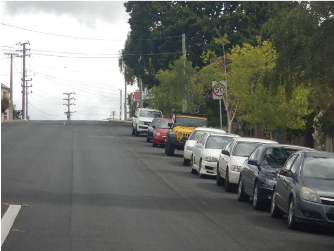
Figure 6 50 km/h speed sign slightly obscured by tree on Forest Road