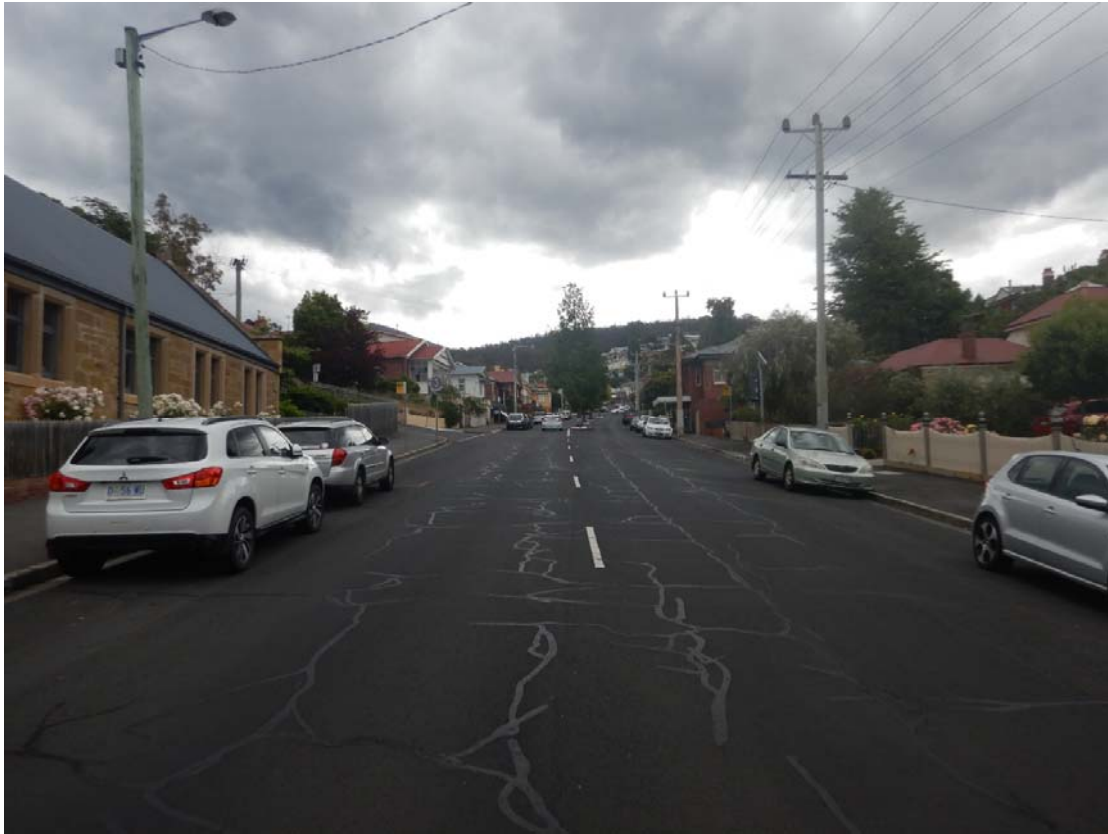
Figure 14 50 km/h speed sign on up hill lane past the school crossing at Cane Street.