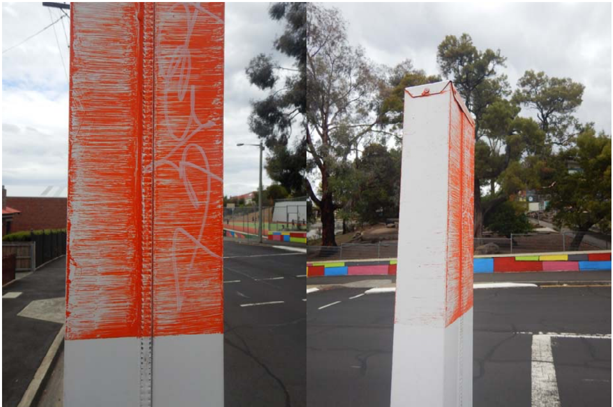
Figure 12 Detail of crossing marker. Note colour has significantly faded and is no longer vibrant or alerting