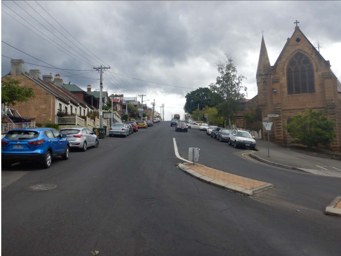
Figure 3 View of Forest Road from Forest Road Goulburn Street Intersection, Note there is no sign indicating the presence of a school.