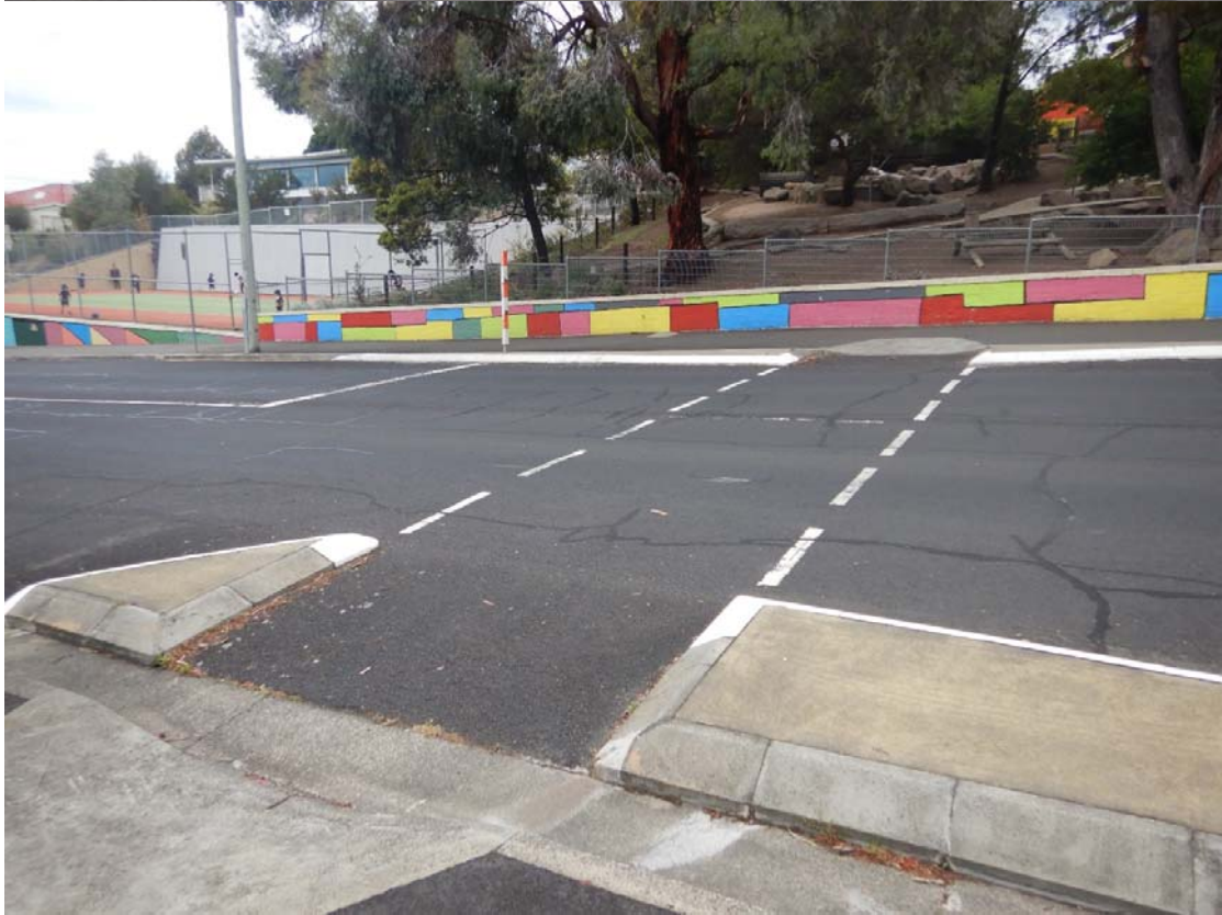
Figure 11 Details of school crossing on Goulburn Street.