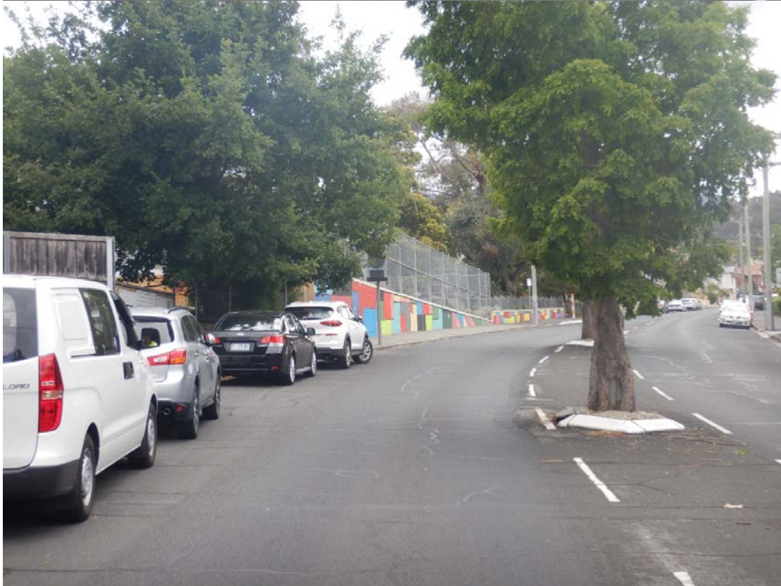
Figure 8 Close up of variable speed signage partially obscured by tree