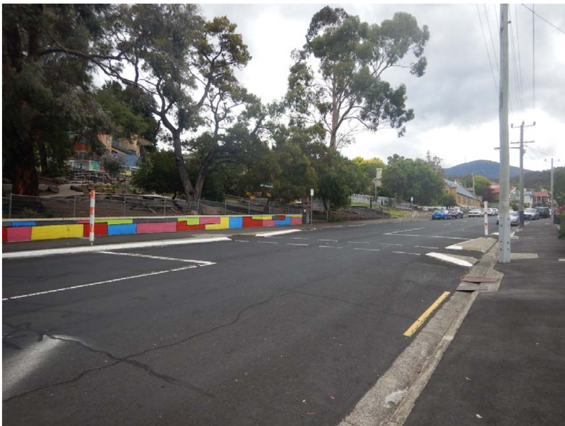
Figure 10 View of School crossing from pedestrian walk way opposite to the school.