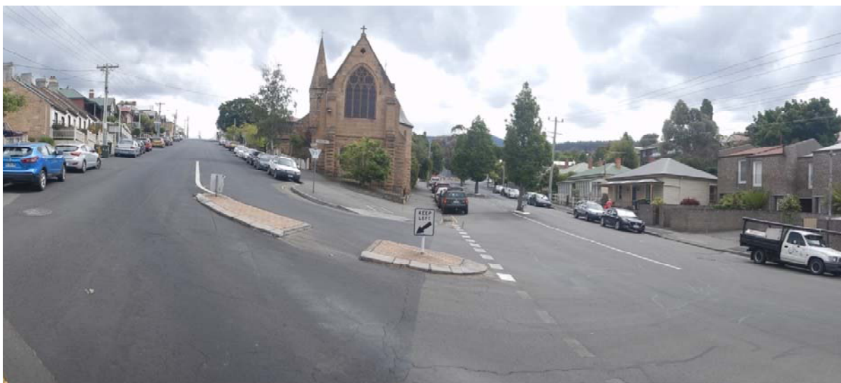
Figure 2 Panorama view of Forest Road intersection.